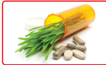
Raw Materials Supplier